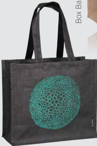
Box Bag, with sari